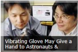
Vibrating Glove May Give a Hand to Astronauts &