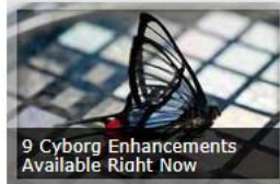
9 Cyborg Enhancements Available Right Now