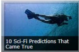
10 Sci-Fi Predictions That Came True