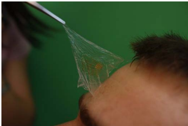
Peels Right Off

In a throat patch experiment, the patch was precise enough for the research team to differentiate several words, according to the National Science Foundation . They were even able to control a voice-activated video game with better than 90 percent accuracy.