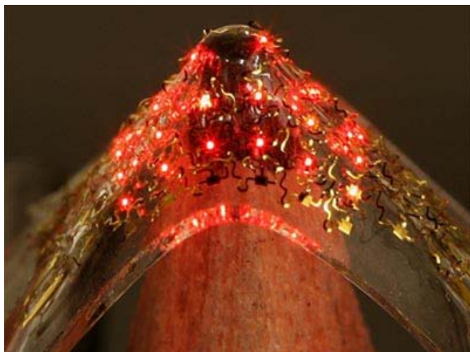
Pencil pushing LEDs

While light-emitting organic materials could have substantially simplified the process of making LEDs on a flexible substrate, organics have other shortcomings "Their brightness can't compete with inorganic LEDs, and encapsulating them to prevent exposure to minute levels of moisture and oxygen is extremely difficult," explains Rogers.