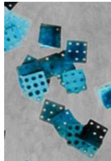
The researchers were able to mass produce very small solar cells.