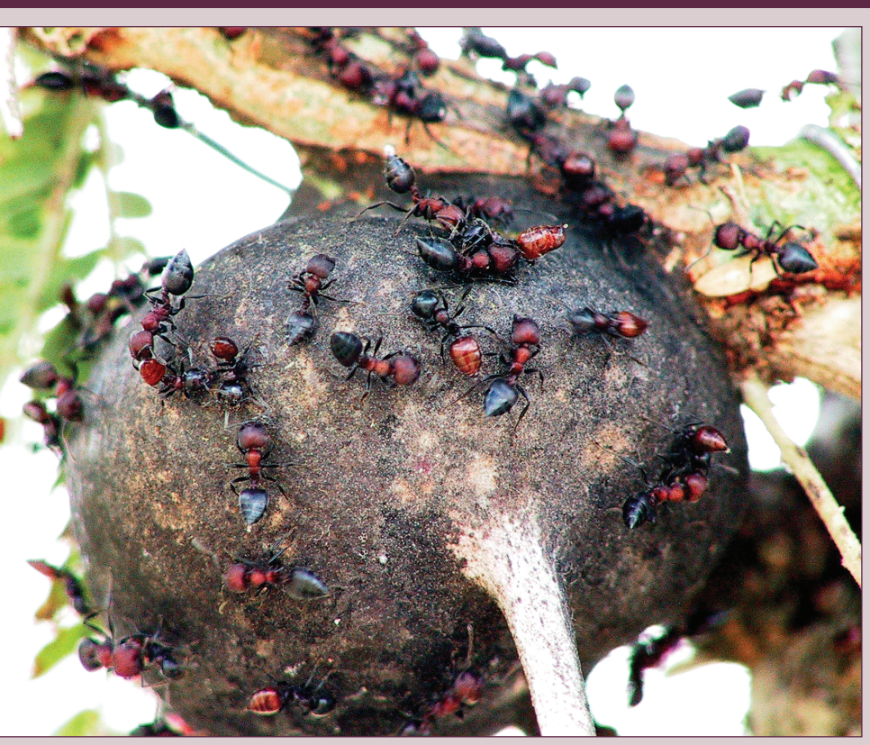
Two ant species battle for possession of a host plant.

The persistence of cooperation between species, or mutualism, despite clear incentives for members to "cheat," is a classic problem in ecology. Traditional explanations focus on short-term, pairwise relationships between partners, even though many mutualists interact with multiple species throughout a lifetime. Todd Palmer et al. (pp. 17234-17239) monitored annual survival, growth, reproduction, and ant occupancy of 1,750 Acacia drepanolobium trees over 8 years, and constructed demographic models that related the trees' lifetime fitness to occupation by four mutualistic species of ants. The authors discovered that the trees demonstrated greatest lifetime fitness when sequentially occupied by the set of all four ant species. As part of a set, even parasitic