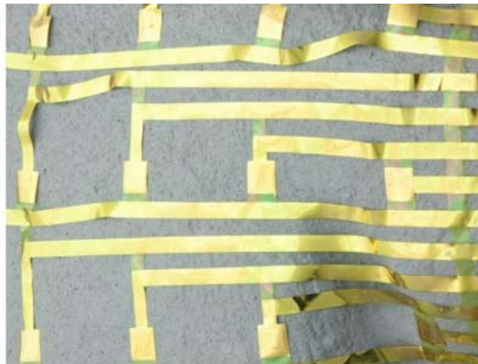
Neural electrode array wrapped onto a model of the brain after dissolution of a thin, supporting base of silk