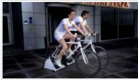
Hotel guests pedal for their supper