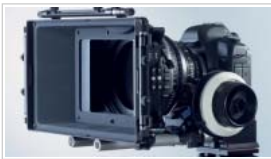
Carl Zeiss introduces dedicated cine lenses for Canon and Nikon DSLRs