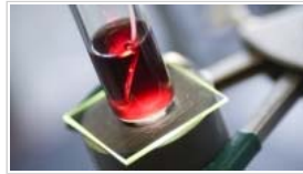
Breakthrough in using sunlight to split water