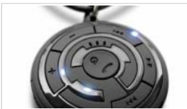
Kisai Escape C - the Bluetooth 'fashion accessory'