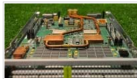
Internet could lower its cooling bills by using hot water