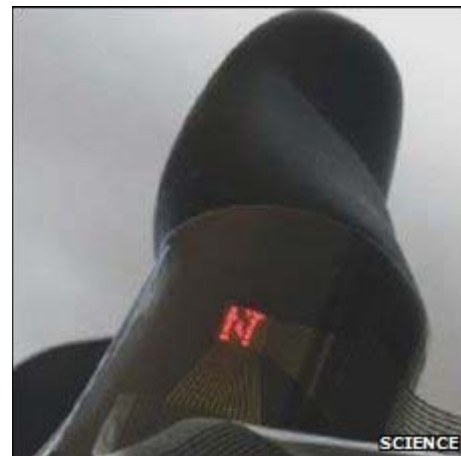
One of the researchers' prototypes wraps neatly around a thumb

For a square centimetre of the material these are 400 times brighter than their organic cousins.