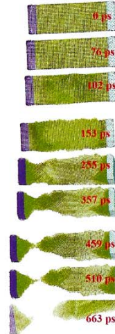
Snapshots of a nanowire breaking.

As the utility of nanowires in microelectromechanical systems and molecular devices increases, knowledge of their failure mechanisms will become more important. New research from Nanjing University in China has identified three strain-rate-dependent breakage mechanisms that result in differing breakage positions [Wang et al. , Nano Lett. (2007) doi: 10.1021/nl0629512]. The researchers used molecular dynamics simulations of single-crystalline Cu nanowires under continuous pulling at varying strain rates to investigate the failure modes. Regardless of strain rate, the crystalline lattice near the center of the nanowire collapses beyond a critical strain into