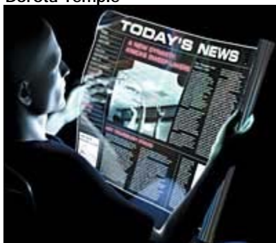
ILLUSTRATION: BRYAN CHRISTIE

Over the past four decades, integrated circuits have worked their way into our computers, televisions, phones, automobiles, appliances, and toys. They're in our air conditioners and airplanes, our cameras and copiers.