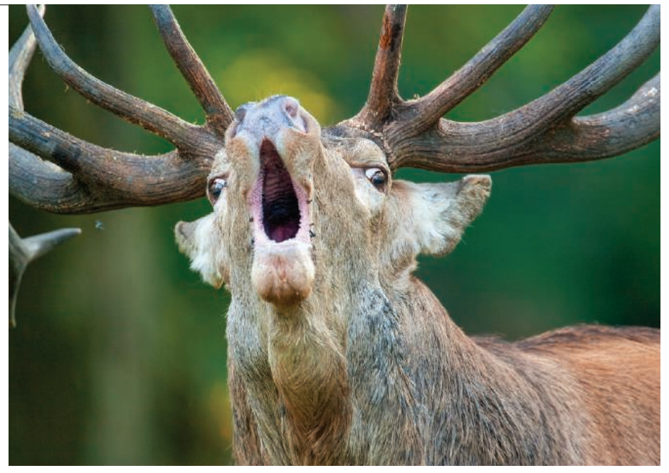
Vocal-respiratory coupling is essential for proper calling, such as by this red deer (Cervus elaphus) during the rut.